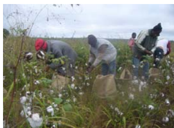
Fig.2 and 3: Cotton harvest in Morrumbala

Harvesting is the last stage of the cotton cultivation process and usually takes place 4 months after the germination of the seeds (Carvalho, 1996). It is of great importance as it determines the amount and quality of the seed cotton produced, as well as the quality of the fibre. If cotton is not harvested when it is ripe it may lose quality, and therefore farmers get less income. Harvest is one of the most unpleasant of the stages in the process as the plant is full of prickly thorns, which hurt when they are handled. In developed countries, this is avoided by using modern cotton harvesters, which in some instances can cover up to 6 to 8 rows at a time and can harvest up to 190,000 pounds of seed cotton a day. However, most of the farmers in Morrumbala and Mutarara district harvest the cotton manually (see illustration below). In the first collection, only first grade cotton is picked and in the second picking, the second grade cotton. The bigger producers hire manual labour, but, owing to financial constraints, most farmers are often unable to hire enough, which may result in delaying the harvest and reducing the quality of the fibre due to exposure to rain, wind and the sun's rays.