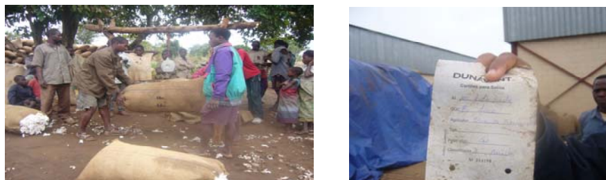
Fig. 4: Cotton weighing at a concentration centre; Fig 5: Label card